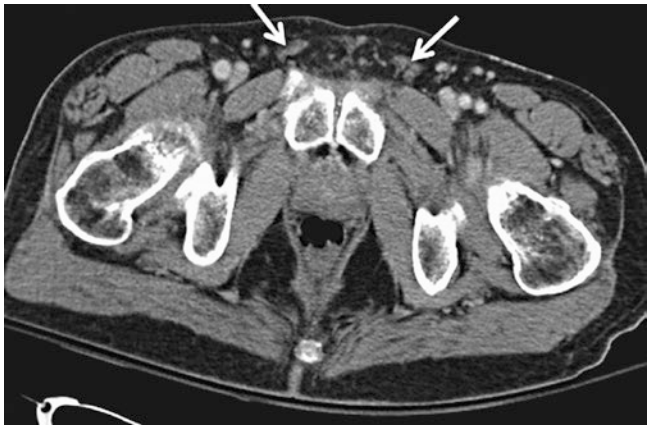
■ Fig. 2.3 Normal pelvic CT without hernia. White arrows: normal inguinal canals

ring) of the hernia sac. This eliminates the patent processus vaginalis. This is all that needs to be done in pediatric cases. The distal sac can be excised if small or left in situ if large. In addition, in adults, the long-standing protrusion of the hernia through the internal ring weakens the surrounding muscle. As such, the floor of inguinal canal is reinforced with a tension-free mesh repair (Lichtenstein repair). With a direct hernia, since there is no patent processus vaginalis, the sac is not opened nor ligated. Since the sac consists of peritoneum and protrudes through the weakened floor of the inguinal canal, the sac is just reduced, and the floor of the inguinal canal is reinforced similarly to indirect hernias with a Lichtenstein repair. An alternative to using mesh is to close the hernia defect and strengthen the floor by sewing the elements of the floor together as a tissue-based repair (Bassini, Shouldice, McVay). Such repairs (without mesh) have the disadvantage of being under tension, and as such the hernia recurrence rates are significantly higher. These repairs are typically reserved for situations where mesh is unavailable, contraindicated (infection, gangrenous bowel), or declined (pain, preference, sensitivity). Laparoscopic inguinal hernia repair may be used to repair indirect, direct, and femoral hernias utilizing a posterior approach to the myopectineal orifice with mesh reinforcement.