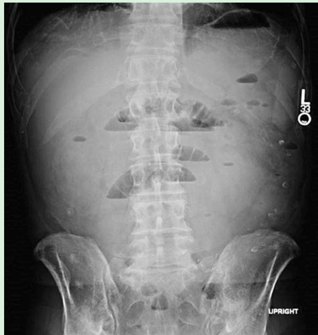
■ Fig. 3.1 Upright abdominal x-ray with air-fluid levels