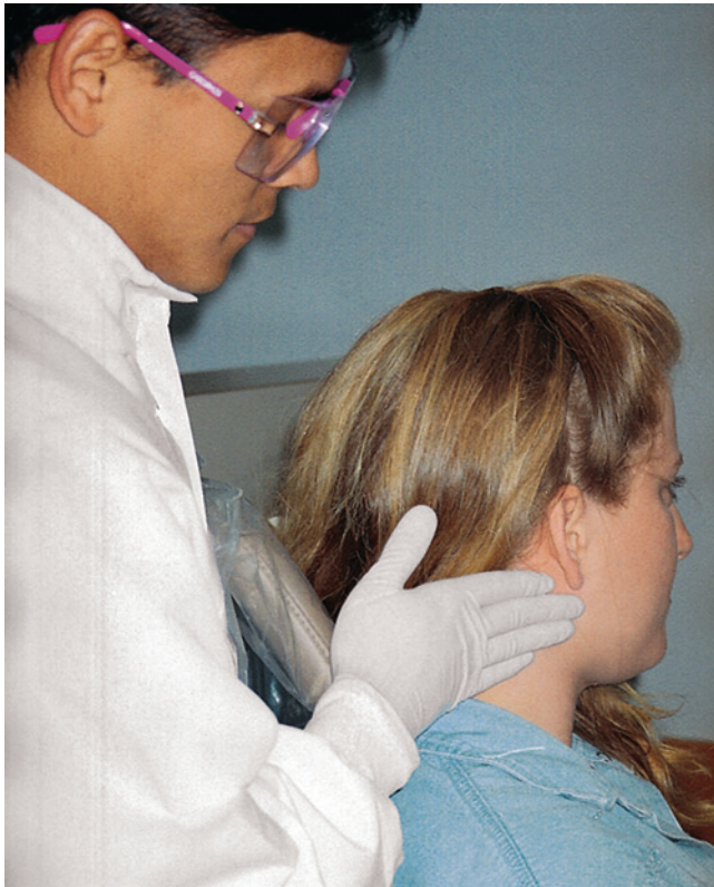
FIGURE 1-1 Examination of the patient is based on an understanding of head and neck anatomy.

The administration of local anesthesia is also based on landmarks of the head and neck. Knowledge of anatomy helps the dental professional plan for use of a local anesthetic to reduce pain levels during various dental procedures. This knowledge also allows for correct placement of the syringe and its anesthetic agent, potentially avoiding complications.