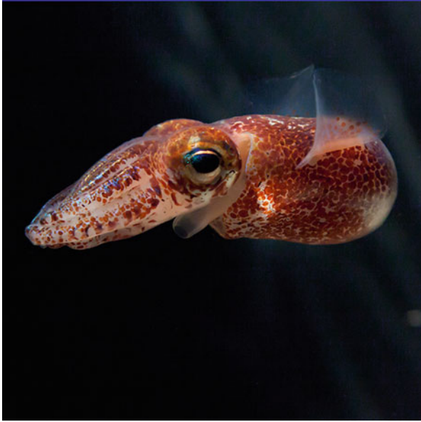
Hawaiian bobtail squid, Euprymna scolopes.

More information about this series at http://www.springer.com/series/11961