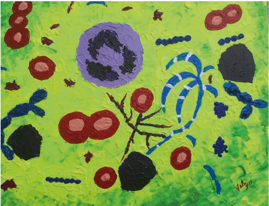
Infections in Neutropenia