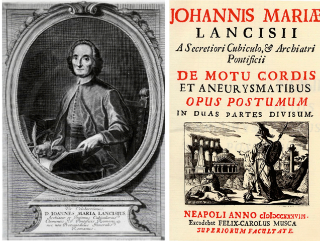
FIGURE 2.1 First historical description of ARVC/D in the book De Motu Cordis et Aneurysmatibus published in 1736 by Giovanni Maria Lancisi, Professor of Anatomy in Rome and Pope's Physician.

Dilatation and aneurysms of the right ventricle (RV), which filled the right chest, were observed at autopsy (Fig. 2.1).