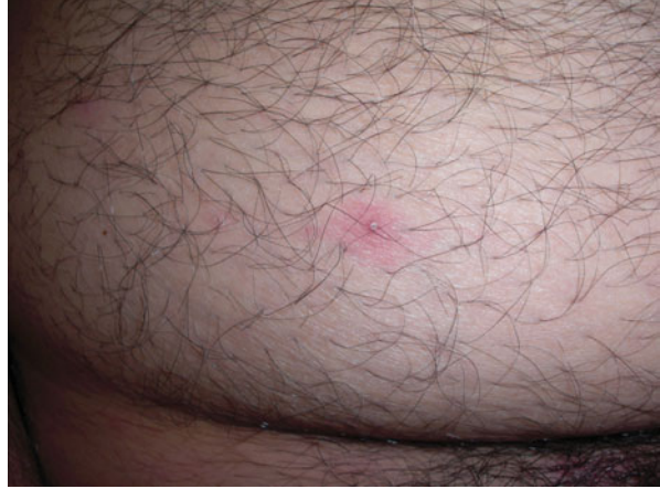
Fig. 1.3 Folliculitis

inflammatory papule then a painful nodule with a central follicular pustule, evolving after a few days leading to spontaneous necrosis and suppuration with discharge of a necrotic core then a permanent scar. Lesions may be single or multiple, involving the face, buttocks, arms, thighs, and anogenital area. There is seldom fever and systemic complications are quite rare. However, with facial furuncles, cavernous sinus thrombosis may constitute a dangerous complication [39].