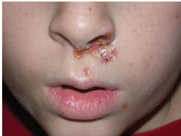
Fig. 1.1 Periorificial crusted impetigo

Ecthyma, more frequent in patients with poor hygiene, is a necrotic complication of streptococcal impetigo, clinically characterized by deep dermal ulcerations.