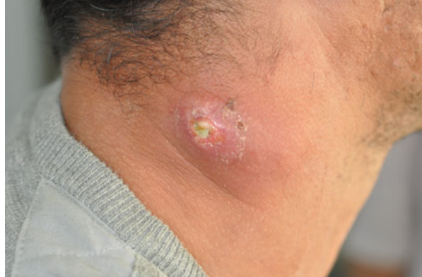
Fig. 1.5 Abscess of the neck

(face for example, etc.), immunosuppression, large volume of the abscess (>5 cm), failure of drainage, extreme age, and the presence of systemic symptoms. In all other cases, antibiotic therapy is not indicated.