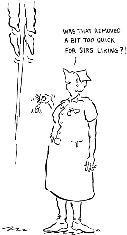
Removing adhesive is hazardous work: Little by little? Or one sudden jerk?... Richard Armour – (See p. 5)

In Nancy Mitford Noblesse Oblige 'An Open Letter' Part III (p. 71)